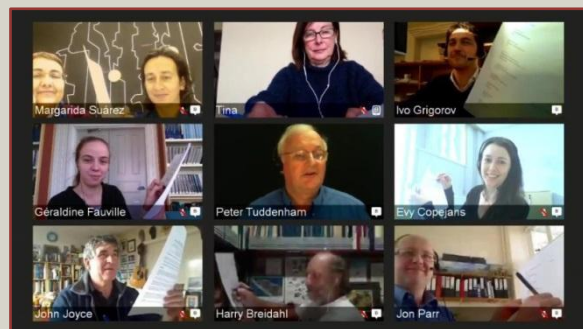
Screenshot of signing Vision Statement on Ocean Literacy (2014)