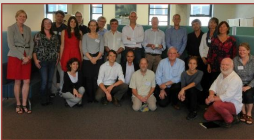
Participants TOL meeting, Plymouth 2013